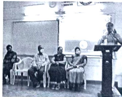
N.S.S. OFFICER S.J.M.V.S. College, Hubballi.