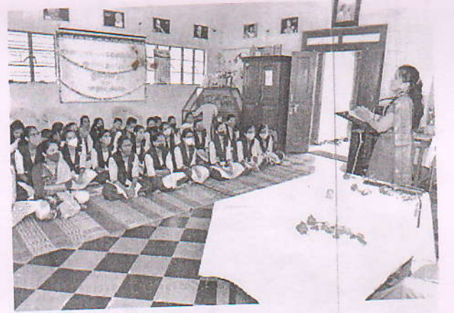
National Youth Day Programme on 12-01-2022