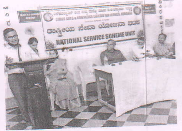
Human Rights Day celebration On 12-12-2021