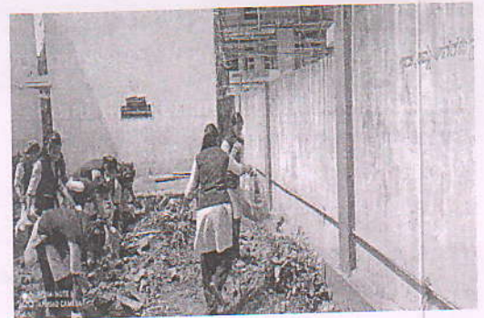
Mahatma Gandhi and Lal Bahadder Shastri Jayanti on 2-10-2021