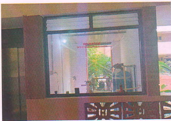
Maintenance of Water bodies